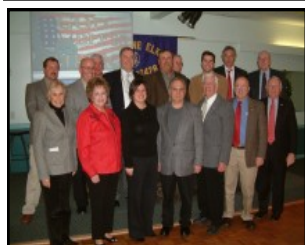
Lodge Installs Members Brigantine Lodge 2428 installed 16 new members on Saturday, Feb. 21. (pictured left). Congratulations!

A reminder that next month is the fifth annual Brigantine Elks Nashville Country Music Night. This year's event will be on Saturday, April 4th, from 8pm to midnight. It is $25 and includes a buffet, beverages and dance lessons. Music will be provided by the 4 Wheel Drive Country Band -- a five-piece band with pedal steel guitar (see www.4-wheeldriveband.com ). Tickets are available at the Lodge, or you can call 266-9826 or visit www.brigantineelks.com for more information. The event benefits Special Needs Children's programs.