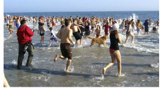
Here are some of the brave souls who threw abandon to the wind and entered the frosty 34 degree surf at the Polar Bear Plunge.

Look around our Lodge and see how many Members are sporting their "Polar Bear" sweatshirt hoodies.